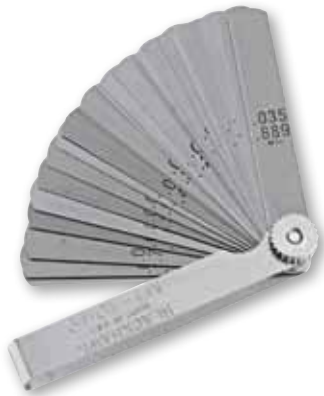
Size Reference Chart